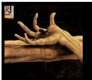
(Jesus Hand & The Nail used with permission by cea.)