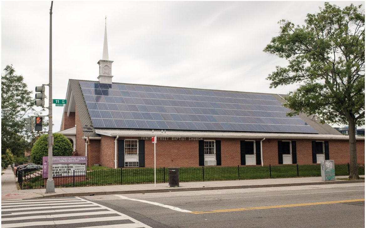
(Solar Panels at 10th Street Baptist Church)

Our population and our use of the finite resources of planet Earth are growing exponentially, along with our technical ability to change the environment for good or ill.